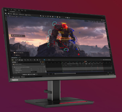
ThinkVision P27u-20 27" 4K UHD Monitor